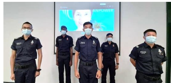
2MIN Josephine Teo with SPF PCG officers

In their video chat with MOS Faishal, SCDF officers who were spending time away from their families made the best of their time at work and reiterated their commitment to protect the nation at a moment’s notice.