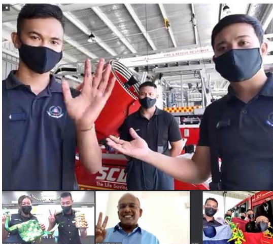
MIN K Shanmugam with SCDF officers at Changi Fire Station

The duty to safeguard our safety and security doesn’t stop on public holidays.