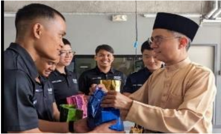
MOS Muhammad Faishal Ibrahim with SCDF Officers.