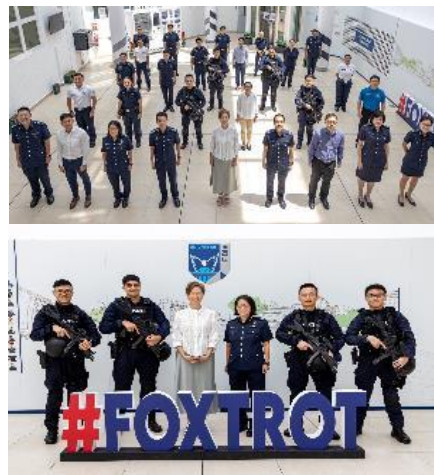
2MIN Josephine Teo with SPF Officers at F Division.