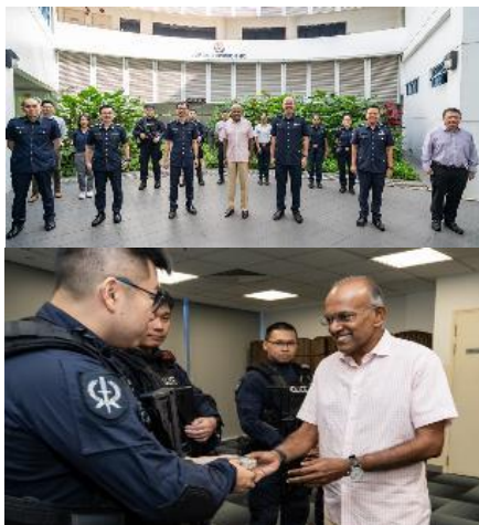
MIN K Shanmugam with SPF Officers at J Division.

Our frontliners work 24/7 to ensure our safety and security. To thank them for their dedication and hard work, MIN K Shanmugam, 2MIN Josephine Teo, MOS Muhammad Faishal Ibrahim and MOS Sun Xueling visited various HTDs on the first day of Hari Raya.