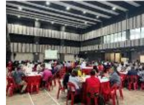
Nee Soon CRRT on 8 July 2023, our first re-engaged CRRT and largest CRRT to date.