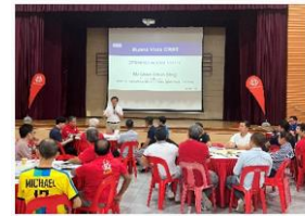
GRA Min Chan Chun Sing giving an opening for the Buona Vista CRRT on 16 September.

A re-engagement with Nee Soon CRRT was held on 8 July. Our largest CRRT to date, over 140 participants across Nee Soon GRC attended and did a tabletop discussion where they shared with one another on their emergency resources and responses based on the different attack scenarios.