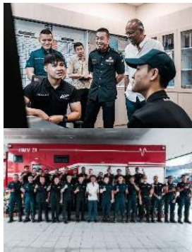
MIN K Shanmugam with SCDF officers

Our frontliners work 24/7 to ensure Singapore's safety and security. To thank them for their dedication and hard work, MIN K Shanmugam, 2MIN Josephine Teo, MOS Muhammad Faishal Ibrahim and MOS Sun Xueling visited HTDs such as Tampines Fire Station, Marina Bay Fire Station, Woodlands Checkpoint and Police Operations Command Centre on Deepavali.