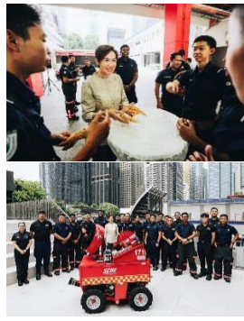
2MIN Josephine Teo with SCDF officers