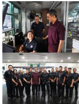
MOS Muhammad Faishal Ibrahim with ICA officers