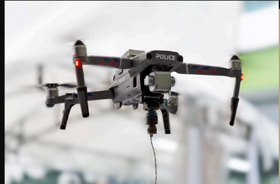
SPF Unmanned Aerial Vehicle on display at the SPF Workplan Seminar in April 2019

Our team gets to work on real operational problems and derives the best solution to ensure homeland security, whether in fire-fighting, policing, or border security. We work closely with our Home Team uniformed colleagues to conceptualise, design, build, test and evaluate new systems to ensure that they are effective for our operations. This organisation offers exciting opportunities for innovative engineers who want to make our country a safer place to live in.”