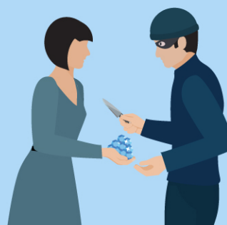
↓ Violent/Serious Property Crimes