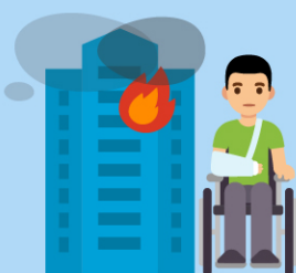
↓ Fire Incidents and Injuries