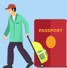
↓ Immigration Offenders