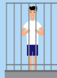
Recidivism rate remained low and stable

TOGETHER WE KEEP OUR HOME SAFE AND SECURE