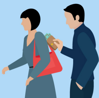
↓ Theft and Related Crimes

In 2017, Singapore continued to be a safe and secure home and remains one of the safest cities in the world.