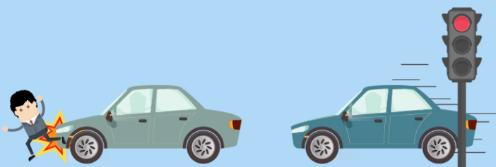
↓ Fatal Accidents and Fatalities