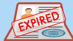
↓ Harbourers and Employers of Immigration Offenders