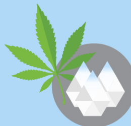
Drug situation remained stable